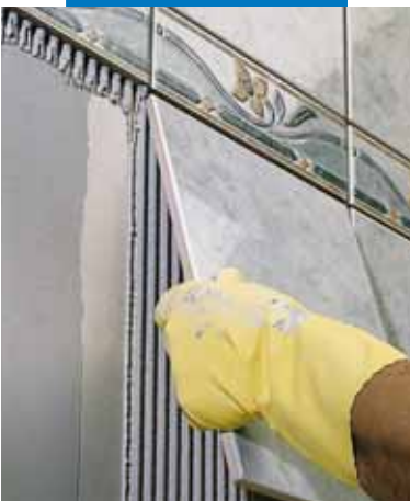
Installation of single-fired tile on wall render