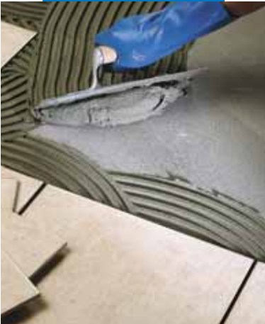
Installation of single-fired tile on floor