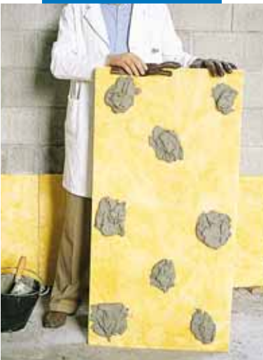
Spot-bonding insulating panels on untreated wall

All relevant references of the product are available upon request.