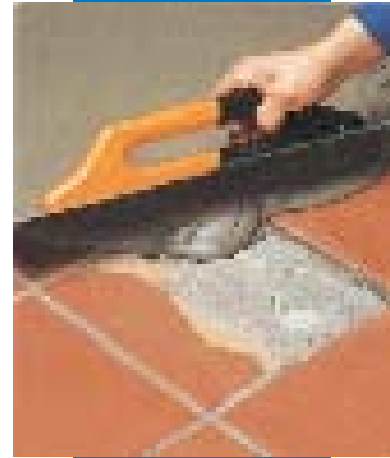
Filling holes with Nivorapid

All relevant references of the product are available upon request