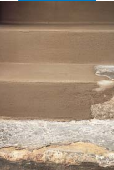
Steps before and after being treated with Nivorapid