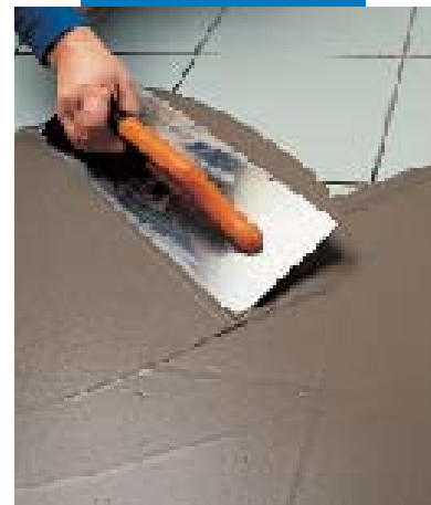
Levelling of existing floor with Nivorapid