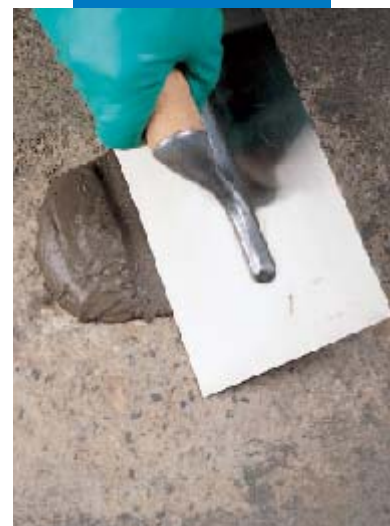
Repairing horizontal arrises with Nivorapid