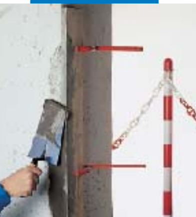
Repairing vertical arrise with Nivorapid