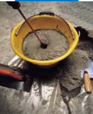
Nivorapid mixed with mechanical mixer