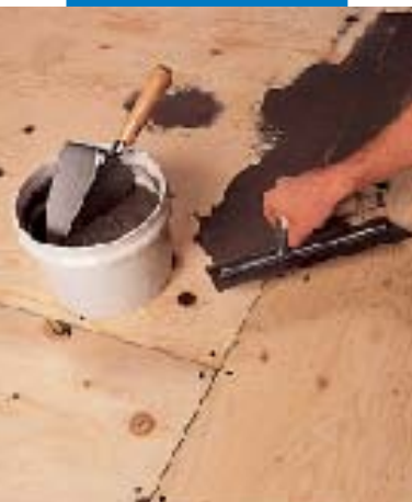
Grouting a plywood substrate with Nivorapid + Latex Plus